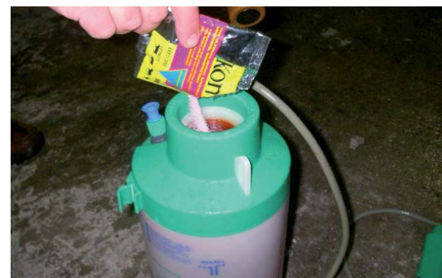
Disinfectant being added to hand sprayer