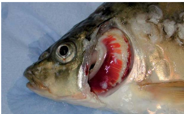
Mirror carp showing clinical signs of Koi Herpesvirus

Equipment that comes in to contact with fish or water should be disinfected after use. In reality common sense should be applied to any situation. The items of tackle most likely to transmit disease include keep nets, landing nets, unhooking mats and stink bags. If items are to be used between waters then precautions should be taken in order to minimise the risk of disease transfer. Anglers fishing multiple waters in a short time should ensure they disinfect their equipment or ideally use separate equipment.