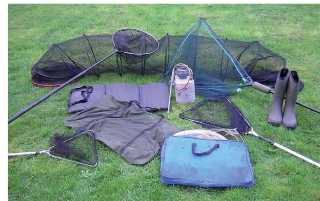
Examples of equipment that should be disinfected

All products used for disinfection should be used in accordance with the manufacturers Health and Safety guidelines.