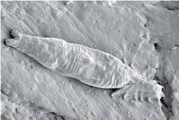
Gyrodactylus salaris on the skin of Atlantic salmon

Iceland has made it mandatory to disinfect angling equipment before fishing. If equipment is disinfected before travelling the angler must obtain a certificate of disinfection from an official veterinary authority. Alternatively, equipment can be disinfected on arrival at Keflavik airport.